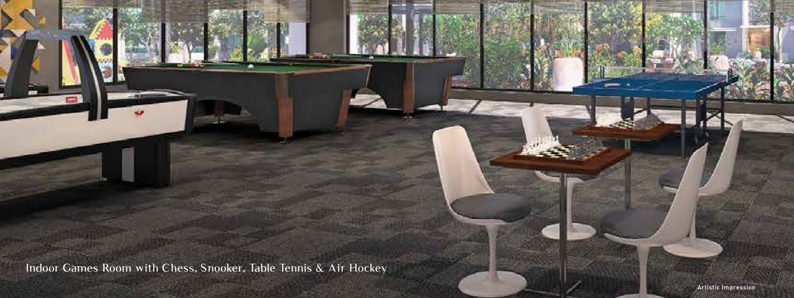
Indoor Games Room with Chess, Snooker, Table Tennis & Air Hockey