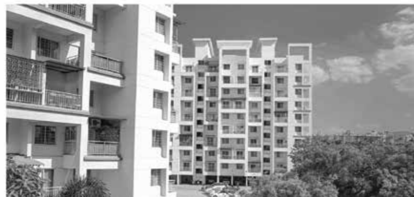
Actual images of delivered projects